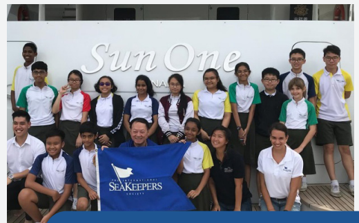
SeaKeepers hosts students from the Changkat Changi Secondary School aboard DISCOVERY Yacht Sun One.