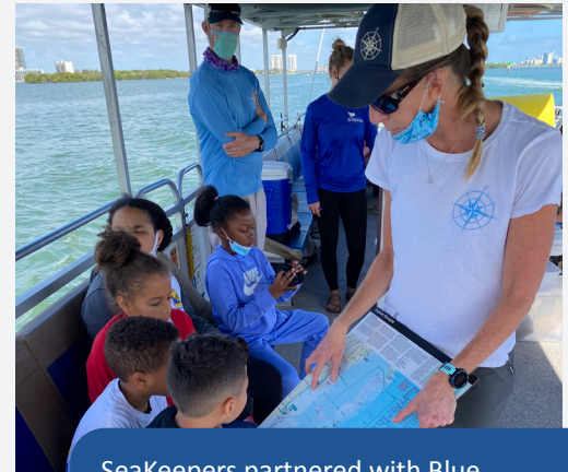
SeaKeepers partnered with Blue Scholars Initiative aboard DISCOVERY Vessel River Queen.

Program engagement ranges from multi-day expeditions to citizen science opportunities which can be done independently on the vessel owner's schedule. Vessel owners who generously donate time on their yachts may qualify for tax benefits to the extent allowed by law and will be recognized at SeaKeepers events, featured on the SeaKeepers website, and acknowledged in the SeaKeepers newsletter. In addition to mobilizing more vessels to engage with ocean conservation, research, and education, the Marina Partner Program is key to promoting best boating practices and protecting the ocean by adopting responsible measures as a vessel owner.