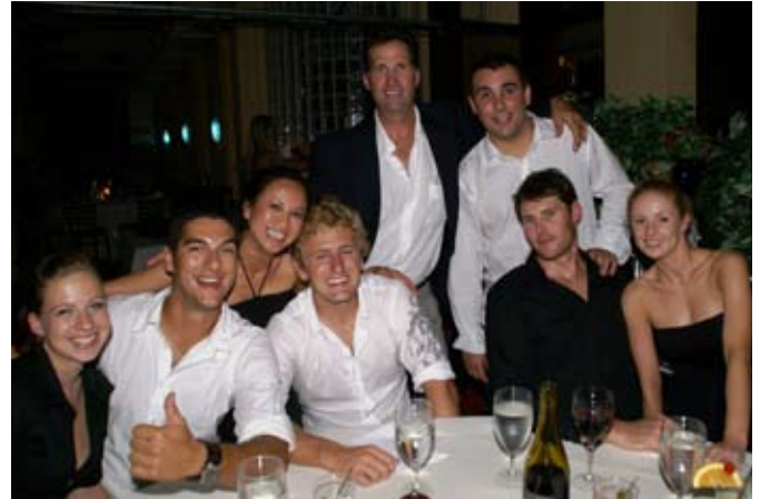
The crew of M/Y Azzurra II attended the inaugural SeaKeepers Soirée , held just before FLIBS. This first event raised more than $70,000 USD. Proceeds from the night went toward the purchase of a SeaKeeper 1000™ monitoring system, to be installed in the Fort Lauderdale Inlet in collaboration with NSU’s Oceanographic Center.

Charitable events for SeaKeepers Professionals will be hosted throughout the year. There is no doubt that these events will be fun, but held for a very worthy cause as well. All proceeds will go to the installation of a SeaKeeper 1000™ oceanographic and atmospheric monitoring system, which will be donated on YOUR behalf, at select locations around the globe.