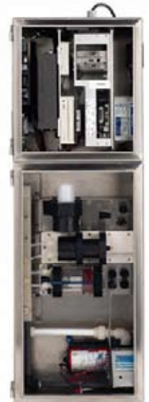
The SeaKeeper 1000™ Monitoring System

In addition, nine major yacht builders have endorsed and become sponsors of the Society. They include OceAnco, Feadship, Delta Marine, Christensen, Trinity Yachts, Shadow Marine, Luerksen, Yainti-Raffles, and Benetti. Patrick Knowles Design, Dockwise Yacht Transport and Only Yacht have recently joined as partners too.