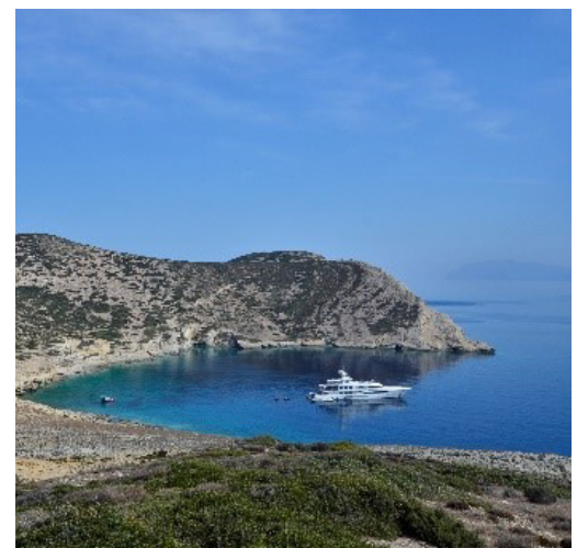
MY Gene Machine