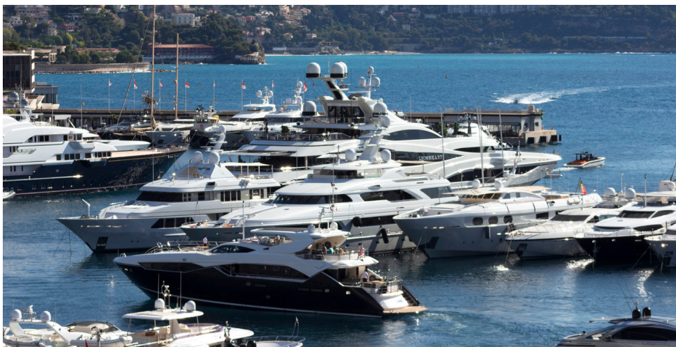
Monaco harbour

Navigational incidents involving superyachts are often quashed by confidentiality agreements which deny lessons to be learnt or shallows to be reported to the hydrographic offices. By contributing data, superyachts can help avoid groundings or environmental damage and make the oceans a safer place for all.