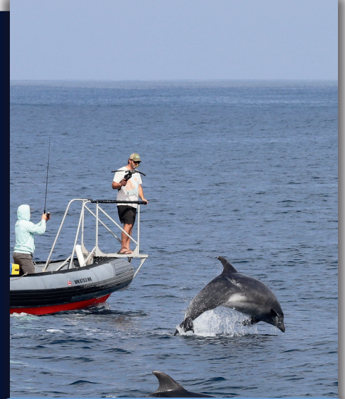
Acoustic Effects of Naval Sonar on Bottlenose Dolphins aboard DISCOVERY Yacht Valkyrie

SeaKeepers collaborates with numerous organizations, academic institutions, and government agencies in delivering its programming. Staff work closely with yacht owners and crew to coordinate research and outreach activities that reflect each yacht owner's ocean-related interests.