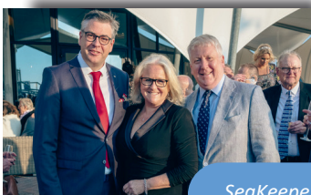
SeaKeepers' United Kingdom Launch

Signature events are hosted globally in cities like Miami, Palm Beach, Fort Lauderdale, London, Monaco, and Singapore, usually coinciding with boat shows. These gatherings bring together influential members of the yachting community annually to celebrate key supporters, influential marine conservation activists, and prominent scientists and educators. The events feature highlights from past programming and recognize the contributions of D/Y Fleet members.