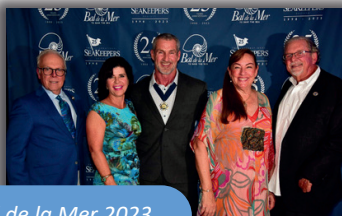
Bal de la Mer 2023

Signature events are hosted globally in cities like Miami, Palm Beach, Fort Lauderdale, London, Monaco, and Singapore, usually coinciding with boat shows. These gatherings bring together influential members of the yachting community annually to celebrate key supporters, influential marine conservation activists, and prominent scientists and educators. The events feature highlights from past programming and recognize the contributions of D/Y Fleet members.