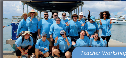
Teacher Workshop with Georgia Aquarium

Yacht donations support our DISCOVERY Yacht Program, encompassing Scientist-Led Expeditions, Citizen Science, Educational Outreach, and Community Engagement. By donating your vessel, you can alleviate ownership costs and potentially reduce income tax burdens (as applicable). SeaKeepers recommends that yacht and boat owners contemplating donations to first consult with their tax advisor for personalized guidance.