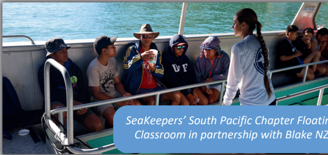
SeaKeepers' South Pacific Chapter Floating Classroom in partnership with Blake NZ

SeaKeepers hosts shoreline and underwater cleanups. As of March 2024, over 160 cleanups have happened, in which 5,750 volunteers have collected 1,150 bags containing 24,228 lbs of trash. SeaKeepers also participates in various capacities with industry partners at yachting functions.