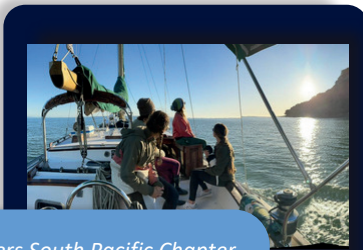
SeaKeepers South Pacific Chapter

SeaKeepers United Kingdom: Since 2021, SeaKeepers has expanded its global presence, particularly in the United Kingdom, with an official launch event held in May 2023. This expansion is expected to enhance opportunities and further programming goals in the region.