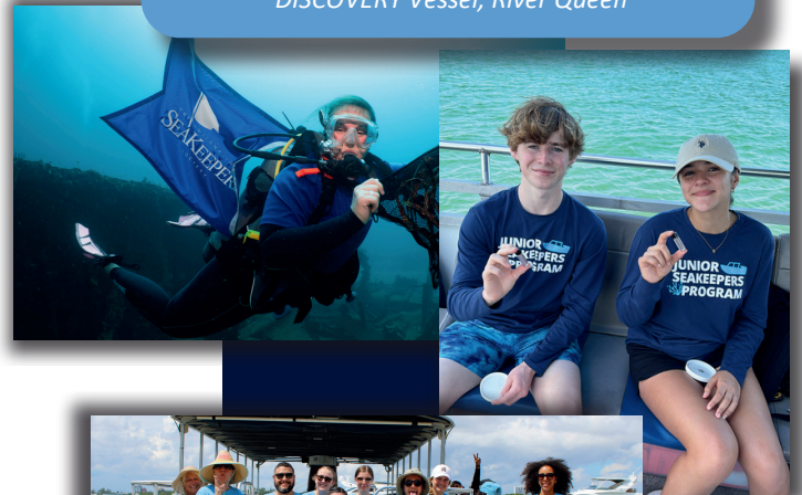
(L) Underwater Dive Cleanup and (R) Floating Classroom in Miami aboard DISCOVERY Vessel, River Queen

Providing free resources that include lesson plans, presentations, marine science kits, e-workbooks and activities to present a fun and interactive way of impacting the next generation.