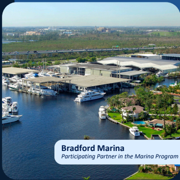
Bradford Marina Participating Partner in the Marina Program