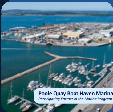
Poole Quay Boat Haven Marina Participating Partner in the Marina Program

Enhance your brand's presence within the SeaKeepers community while offering your clientele a unique opportunity to engage in ocean conservation and education.