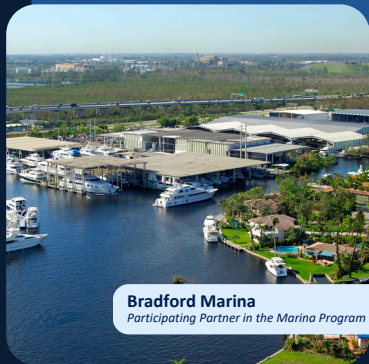
Bradford Marina Participating Partner in the Marina Program