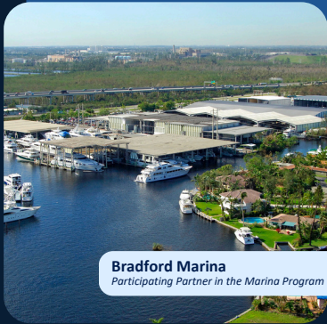
Bradford Marina Participating Partner in the Marina Program