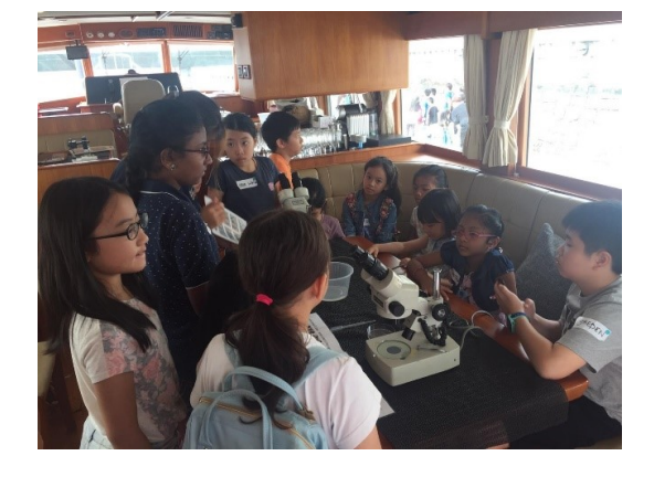
Educational Outreach On June 21<sup>st</sup>, thirty children hosted by the Singapore Chapter were treated to sustainability themed sessions. Learn more!