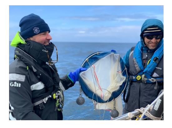
Scientist-Led Expedition On May 7<sup>th</sup>, aboard D/Y SAM, the crew set northward to the Aleutian Islands for the third leg of her voyage focused on genomic discovery. Learn more!

Citizen Science In June, aboard D/Y SeaWolf, SeaKeepers teamed up with SoFar to deploy the spotter drifter. <u>Learn more!</u>