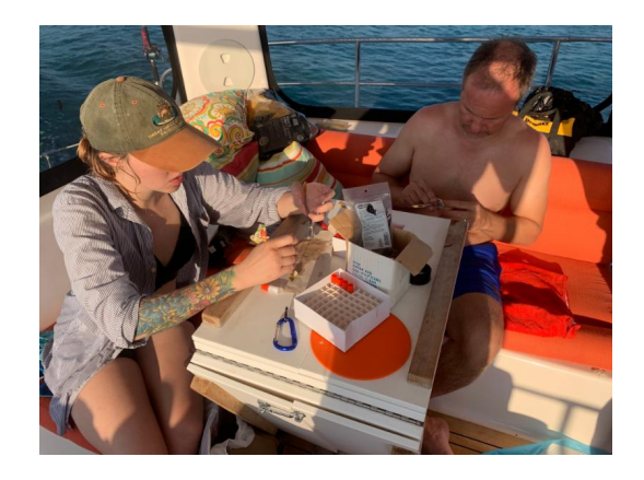
Scientist-Led Expedition On June 1<sup>st</sup>-15<sup>th</sup>, aboard D/Y Catniss, SeaKeepers joined researchers from the University of Texas to conduct coral research. Learn more!

On May 20<sup>th</sup> – 26<sup>th</sup>, aboard M/Y Sharkwater, The International SeaKeepers Society joined Beneath the Waves and Fins Attached to conduct shark research, while also filming a National Geographic documentary. <u>Learn more!</u>