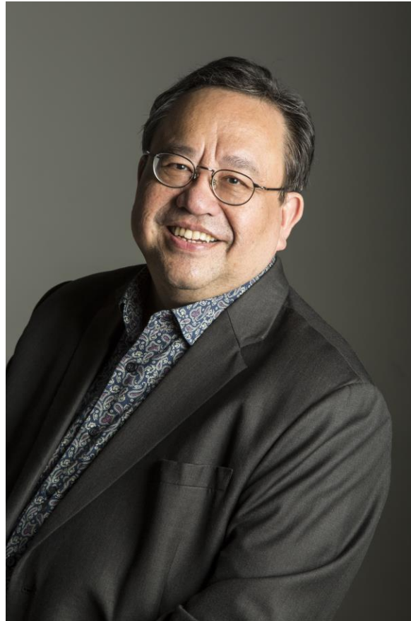
Jeremy Monteiro Jazz Association Singapore Executive Director & Music Director

Jazz Pianist, composer, producer, vocalist and educator. Jeremy has been a professional musician since 1976 with more than 40 solo albums to his name. He has received Singapore's highest honour, The Cultural Medallion in 2002.