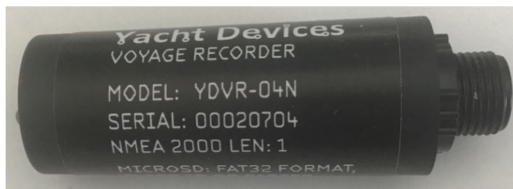
Figure 3 (above): The Yacht Devices Voyage Data Recorder (VDR) for recording NMEA2000 data, showing the main device body (right) and NMEA2000 connector (left) with polarized plug.