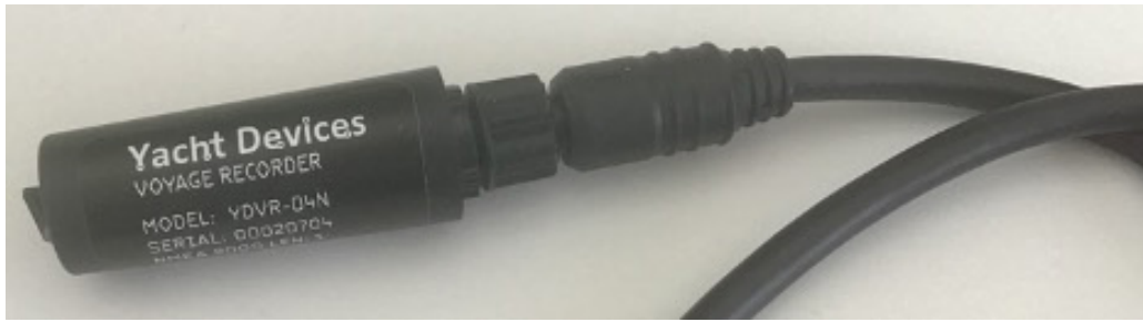
Figure 4 (above): The Yacht Devices data recorder connected to a NMEA2000 drop cable, ready to collect data.

Data is recorded to a micro SD card, which is inserted into the end of the data logger, Figure 5. The socket is a push-push type, meaning that the card has to be pushed in to seat, and again to release. The data logger assumes that the micro SD card is formatted as FAT32 file system, but this is typically done at the factory.