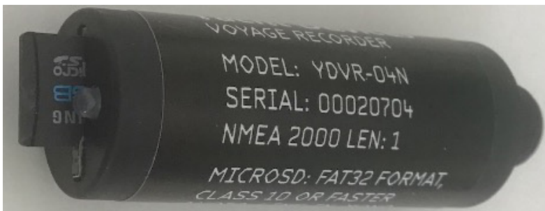
Figure 5 (left): Inserting the micro SD card into the Yacht Devices recorder. The card socket is a push-push type, so the card fully inserted (bottom) needs to be pushed again to release (top) for removal. Data being accepted will be indicated on the adjacent LED.

Data is recorded to a micro SD card, which is inserted into the end of the data logger, Figure 5. The socket is a push-push type, meaning that the card has to be pushed in to seat, and again to release. The data logger assumes that the micro SD card is formatted as FAT32 file system, but this is typically done at the factory.