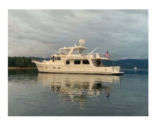
Humpback Whale Acoustics Research