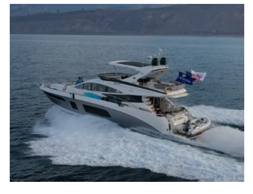
Juvenile White Shark Research

University of California Davis, Alaska Whale Foundation & SETI recorded and observed sounds made by whales through a hydrophone in Alaska aboard DISCOVERY Yacht Blue Pearl.