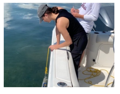
Water Sampling with RSMAS