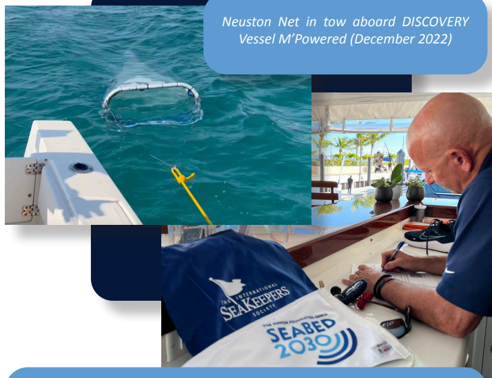
Neuston Net in tow aboard DISCOVERY Vessel M'Powered (December 2022)

We are always finding new projects, initiatives, and new opportunities. To be kept up to date, contact us at programming@seakeepers.org .