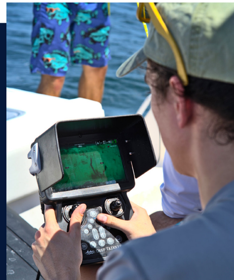
SeaKeepers partnered with NOVA for a deployment of a mini ROV aboard the tender to DISCOVERY Yacht Marcato (August 2020)

SeaKeepers collaborates with numerous organizations, academic institutions, and government agencies in delivering its programming. Staff work closely with yacht owners and crew to coordinate research and outreach activities that reflect each yacht owner's ocean-related interests.