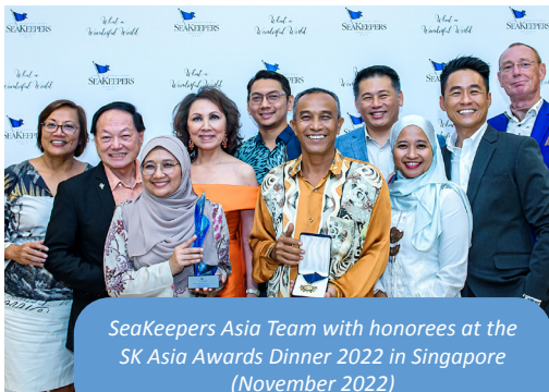
SeaKeepers Asia Team with honorees at the SK Asia Awards Dinner 2022 in Singapore (November 2022)

Since the Fall of 2020, SeaKeepers Asia in collaboration with SeaKeepers Headquarters, has established the Green Marine Program, including a green boaters guide, a carbon footprint calculator, blogs, and a recognition page for vessels implementing sustainable practices.