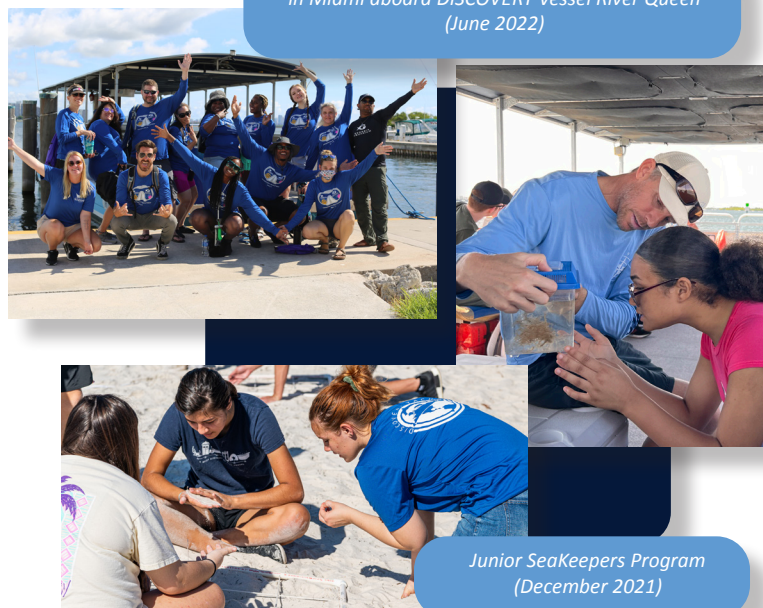
Junior SeaKeepers Program (December 2021)