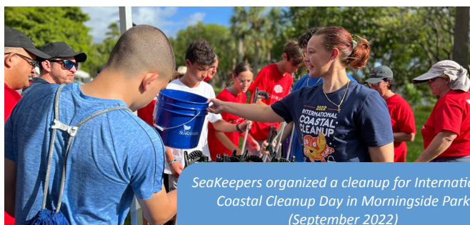
SeaKeepers organized a cleanup for International Coastal Cleanup Day in Morningside Park (September 2022)