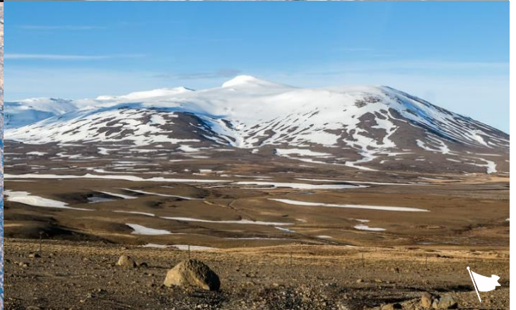
Arctic Habitats (Sea Ice, Glacier, Ice Sheet and Tundra)