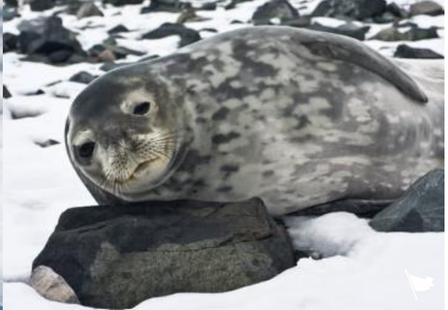
Arctic Biodiversity (Arctic Tern, Orca, Polar Bear and Ringed Seal)