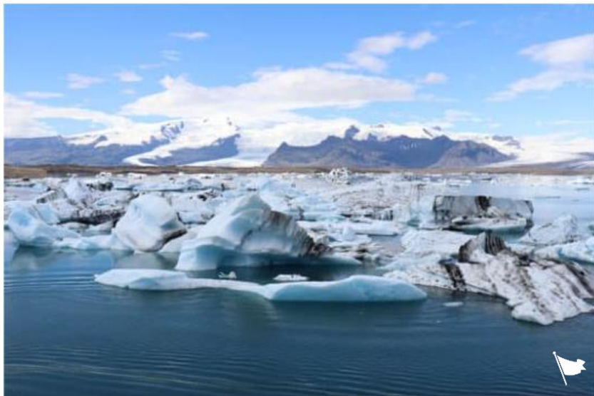
Images of Climate Change in the Arctic