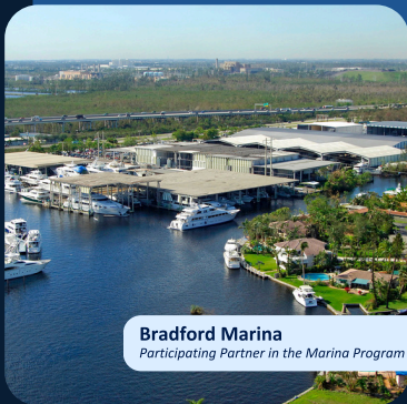
Bradford Marina Participating Partner in the Marina Program