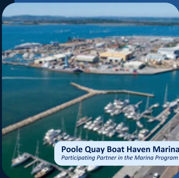
Poole Quay Boat Haven Marina Participating Partner in the Marina Program

Enhance your brand's presence within the SeaKeepers community while offering your clientele a unique opportunity to engage in ocean conservation and education.