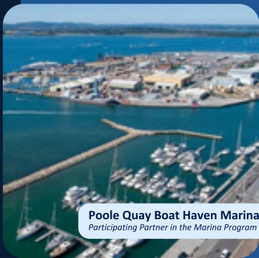
Poole Quay Boat Haven Marina Participating Partner in the Marina Program

Enhance your brand's presence within the SeaKeepers community while offering your clientele a unique opportunity to engage in ocean conservation and education.