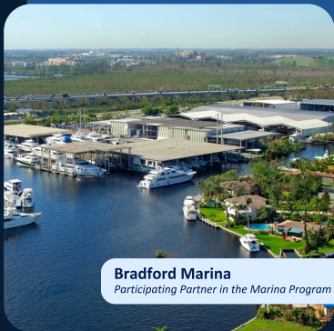
Bradford Marina Participating Partner in the Marina Program